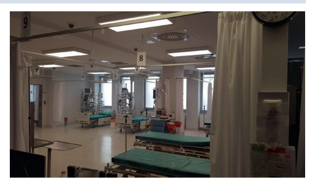
Fig. 2. - Emergency Department Medical University of Białystok Clinical Hospital

System interact. System interact - organizational units of hospitals specialized in the field of healthcare services necessary for emergency medical services,